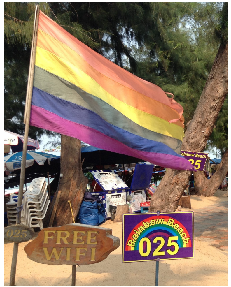
Rainbow Beach Jomtien, Pattaya, Thailand