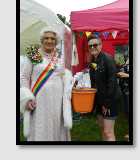
Spot The Queen !!