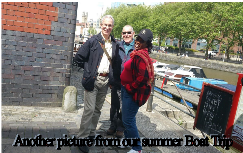
Another picture from our summer Boat Trip

Prices are from £15.00 but will vary, so please check.