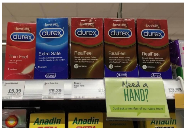
Above sign spotted by an observant GayWest member

THIS IS YOUR PAGE WHERE YOU CAN VOICE YOUR OPINIONS ON JUST ABOUT ANY SUBJECT AND YOUR MAGAZINE AND IT'S CONTENTS.